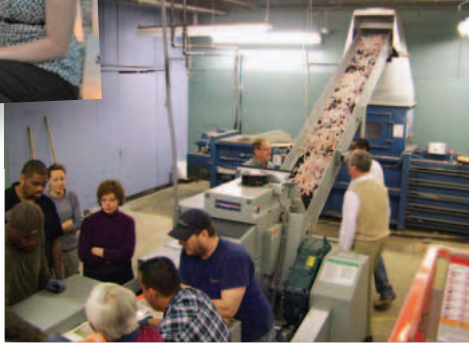
DeCycleIt! helps the environment recycling electronic media.