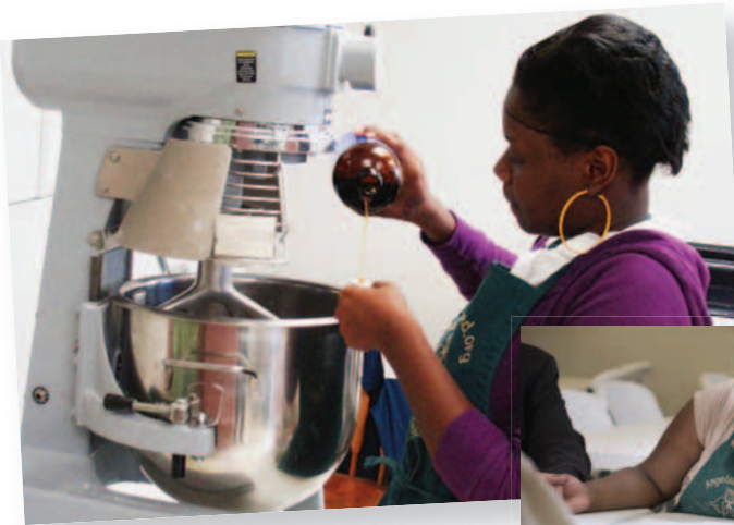
Angel Baked Cookies earns revenue while teaching business skills to youth.