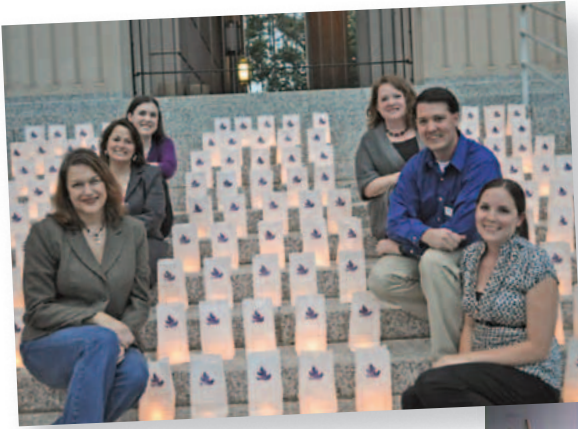
Consolare makes home goods to fund services for crime victims.