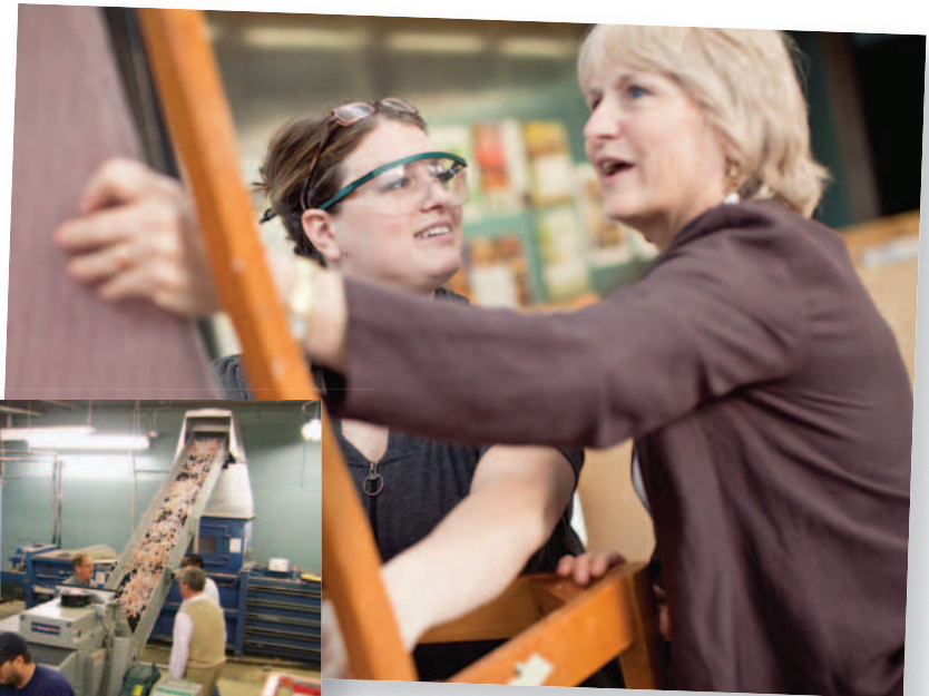
Perennial teaches reuse and restoration workshops to create a better environment.